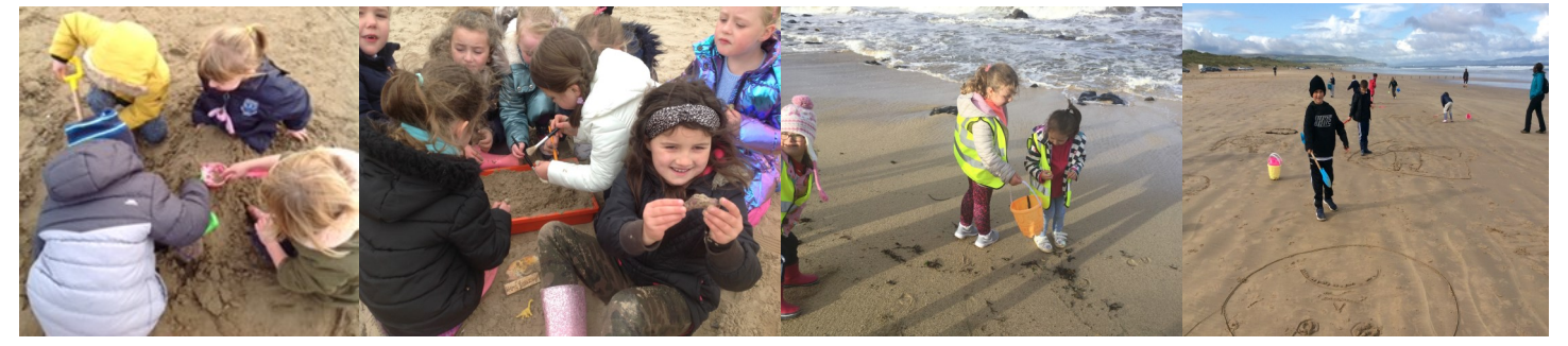
Year 5 Year 6 Year 7 Litter Pick